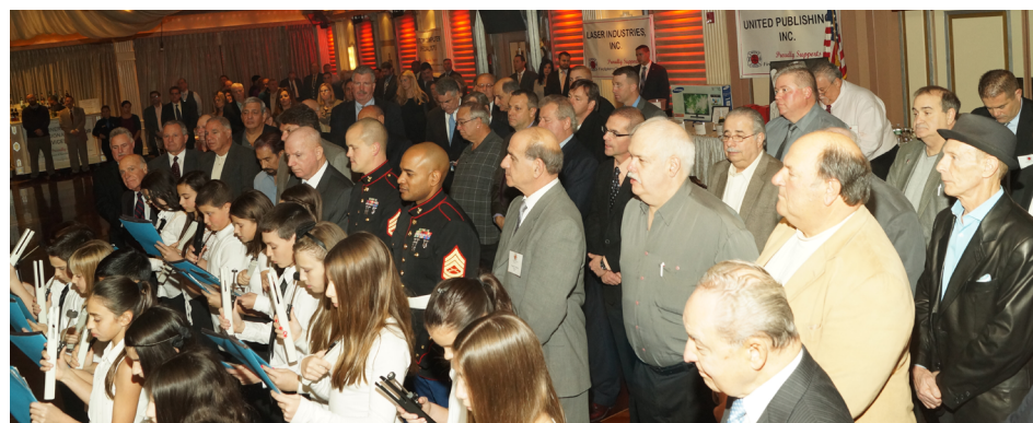
(from page 1) Firefighters, first responders, veterans, and police officers gather as the East Lake Elementary Hand Bell Choir perform the Star Spangled Banner

We encourage you to work with us and your financial advisor to include Planned Giving in your Estate Plan to help support the long-term goals of The Firefighters Charitable Foundation.